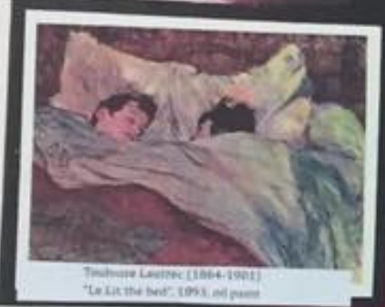
Toulouse-Lautrec (1864-1901) "Le Lit" (the bed), 1893, oil paint