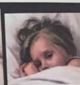
"Catching Zzz's", 2014 oil on archival aluminum panel